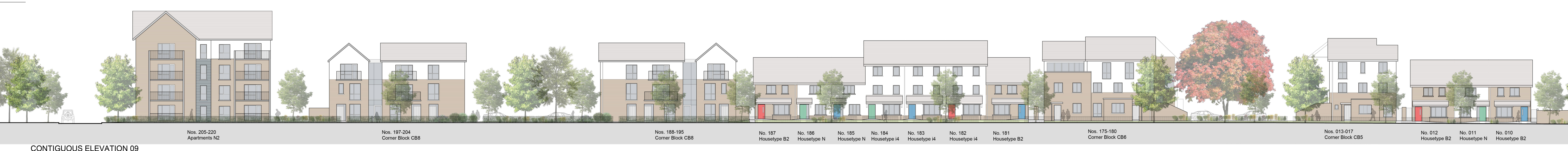
CONTIGUOUS ELEVATION 09

issue PLANNING CONROY CROWE KELLY ARCHITECTS 65 MERRION SQUARE DUBLIN 2 PHONE 66139901 FAX 6765715 E-MAIL info@cck.ie