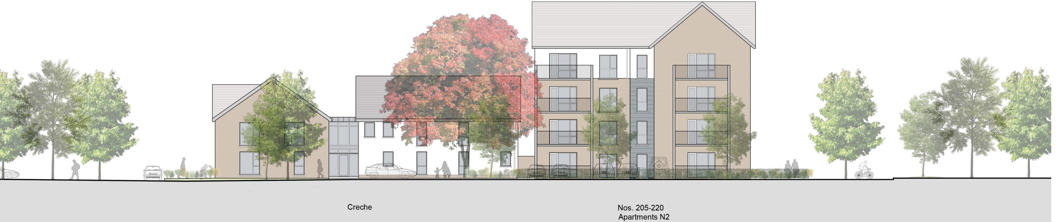
CONTIGUOUS ELEVATION 10 CONTINUED