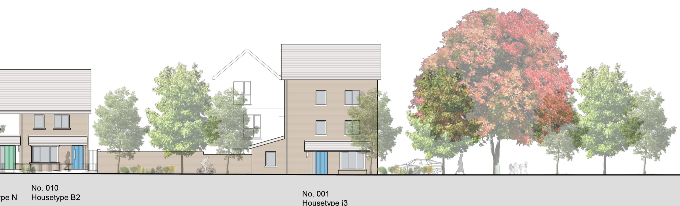
CONTIGUOUS ELEVATION 09 CONTINUED